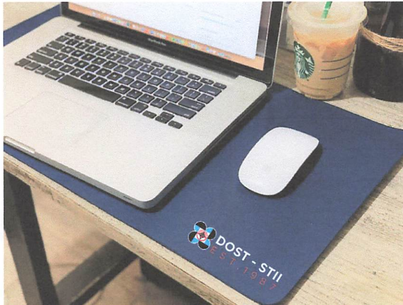
Sample Design using Navy Blue Leather Mat