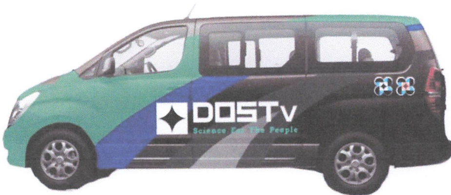
SIDE - LEFT