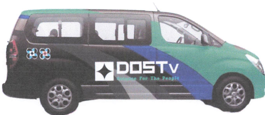
SIDE - RIGHT