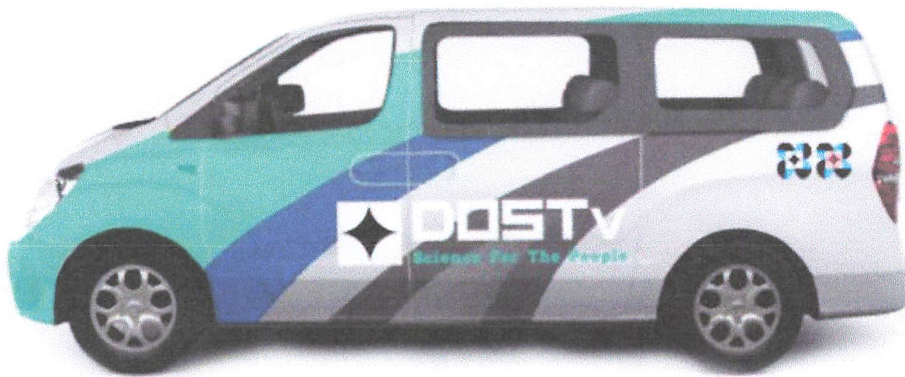
SIDE - LEFT